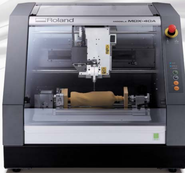
Photo: MDX-40A and optionally available ZCL-40A rotary axis unit

The Roland MDX-40A 3D milling machine is an affordable, easy-to-use prototyping solution that supports a wide range of materials including resin. A new optional rotary axis unit is available, supporting larger materials.